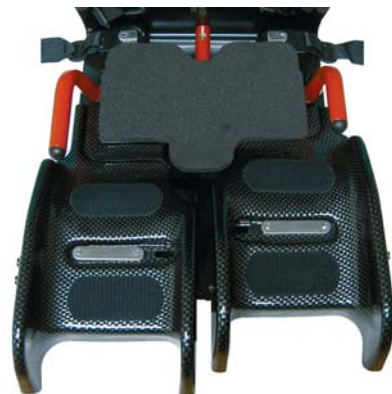
Leg length difference