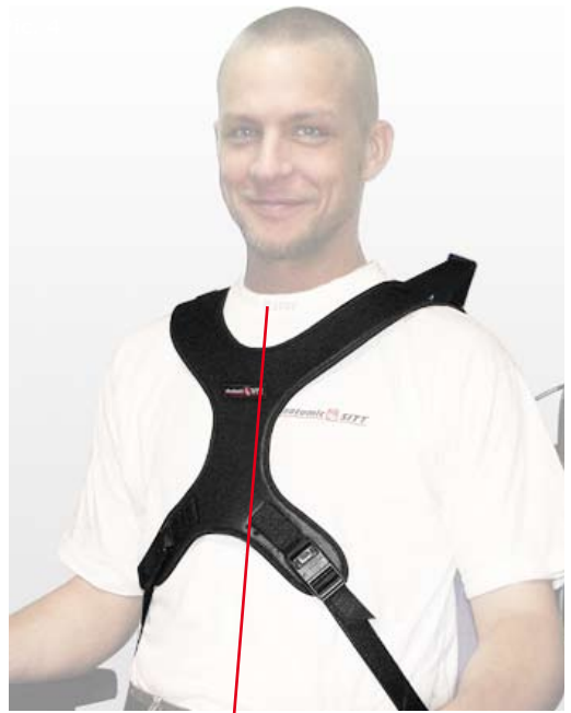
Make sure that there is enough space for the neck.

Sternum support should be mounted by a medical / qualified therapist only