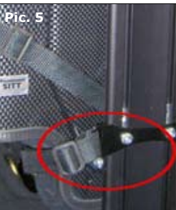
lower attachments - Delfi